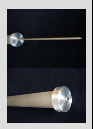
Optional lightning rod

*Site-specific mounting hardware is necessary with theses antennas. Please consult JAG to determine suitable clamps for your application.