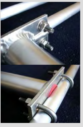
Heavy-duty dipole fixture